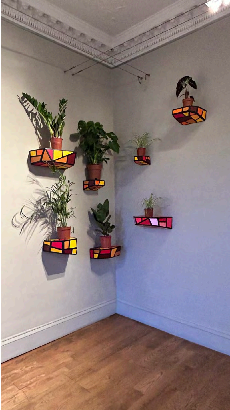
RICHARD WOODS STONE WORKS (x8) DIMENSIONS VARIABLE, PLYWOOD, ACRYLIC PAINT, WATER-BASED RESIN 2026