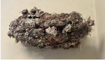
PHYLLIDA BARLOW NOT YET TITLED WOOD, METAL AND GRAPHITE 28(H) X 40(D) X 56CM 2009