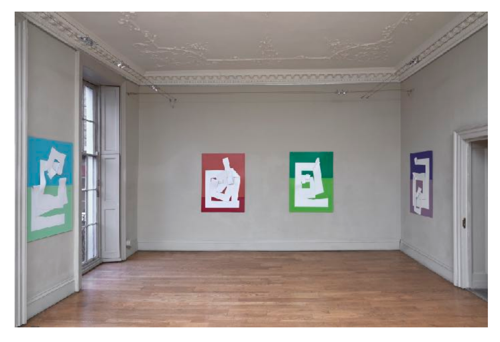
left to right: Traversal 6 , 120x90x4cm; Traversal 9 , 121x90x5cm; Traversal 7 , 122x90x1cm Traversal 3 , 110x85x2cm; all: paint on steel, 2022