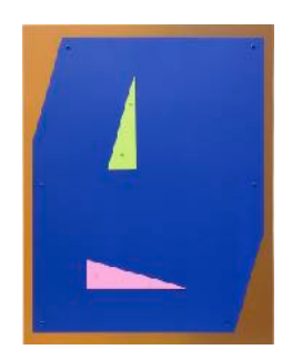
Andy Kaufman's Elvis paint on steel 69x54cm 2022