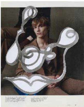
BOY WATERCOLOUR ON CARTRIDGE PAPER ATTACHED TO 'FT HOW TO SPEND IT' MAGAZINE PAGE PAPER 35 X 28CM FRAME: AMERICAN BLACK WALNUT, 41 X 33.5CM (AR/UV MUSEUM GLASS 70%) 2022