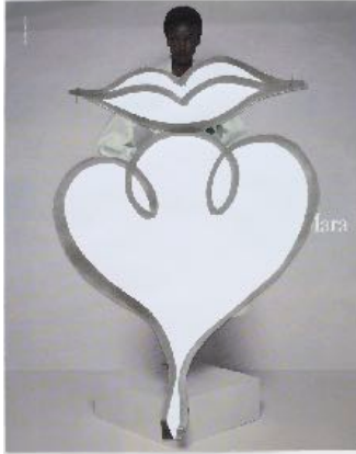
MAX MARA WATERCOLOUR ON CARTRIDGE PAPER ATTACHED TO 'FT HOW TO SPEND IT' MAGAZINE PAGE PAPER 35 X 28CM FRAME: AMERICAN BLACK WALNUT, 41 X 33.5CM (AR/UV MUSEUM GLASS 70%) 2022