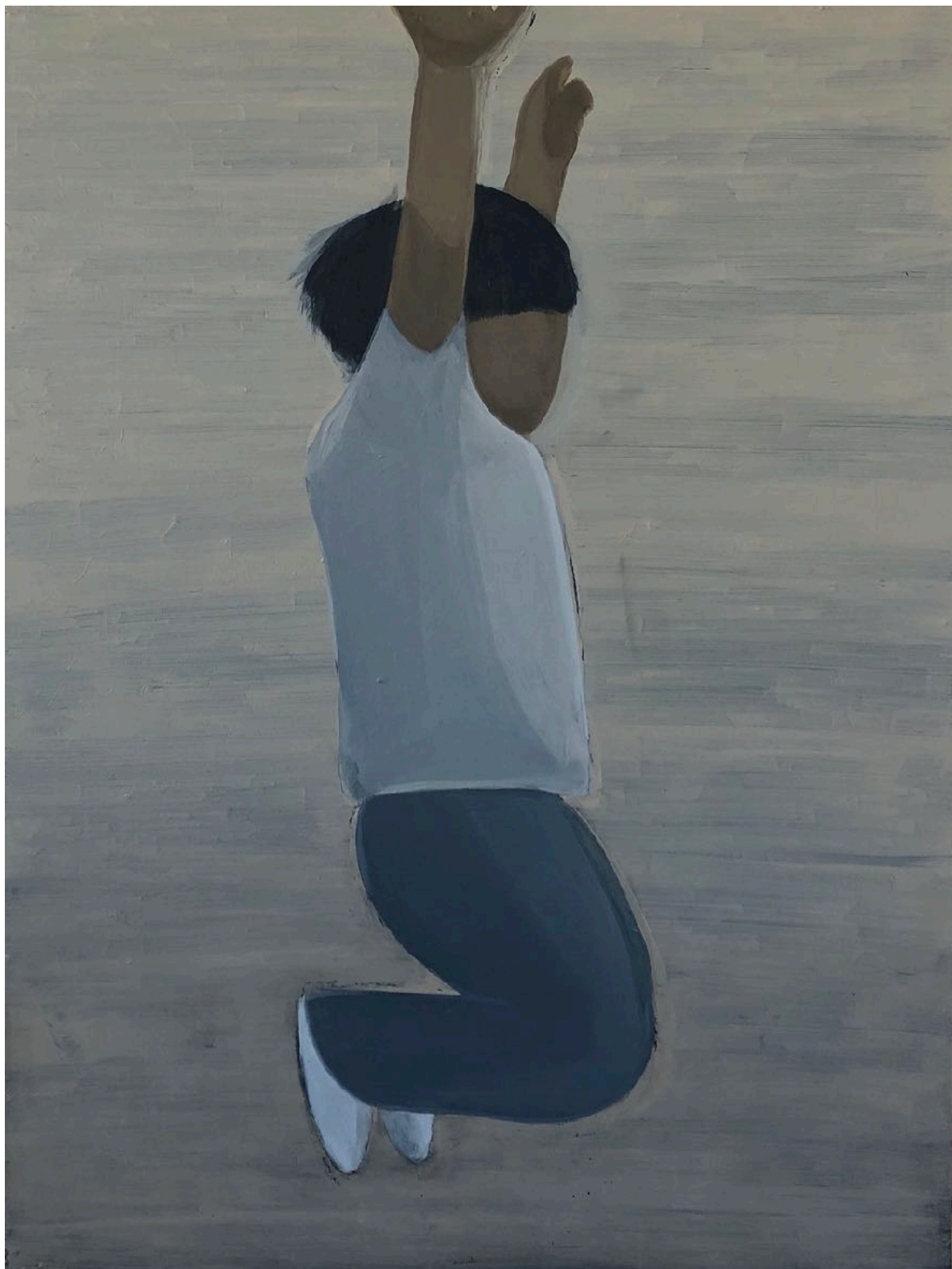
Miho Sato School Ground 3 2020, 102x77cm acrylic on board