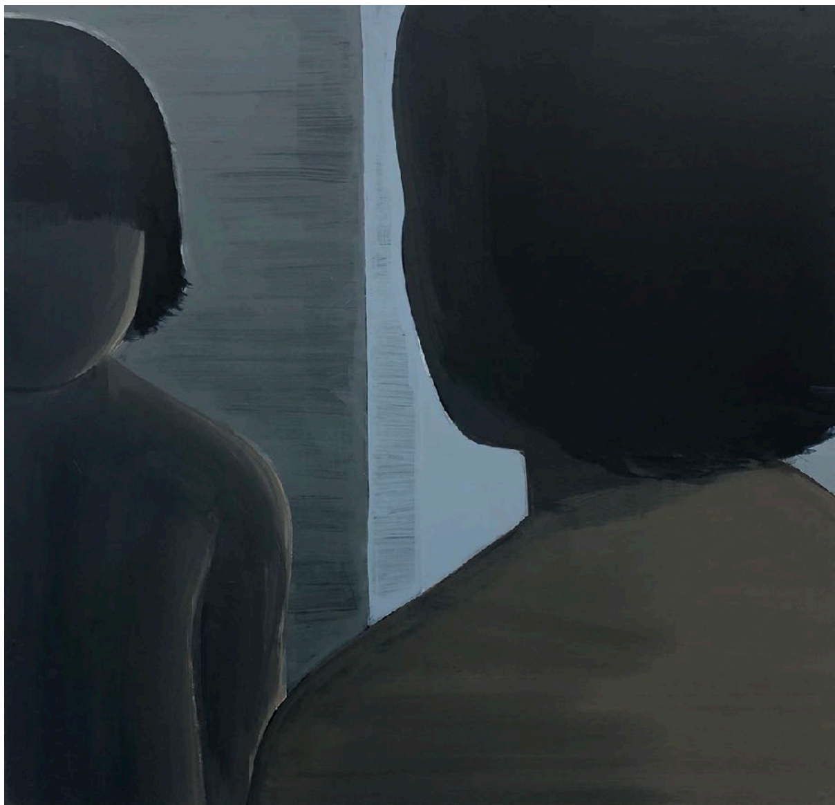
Miho Sato Untitled (mirror) 2020, 80x84cm acrylic on board