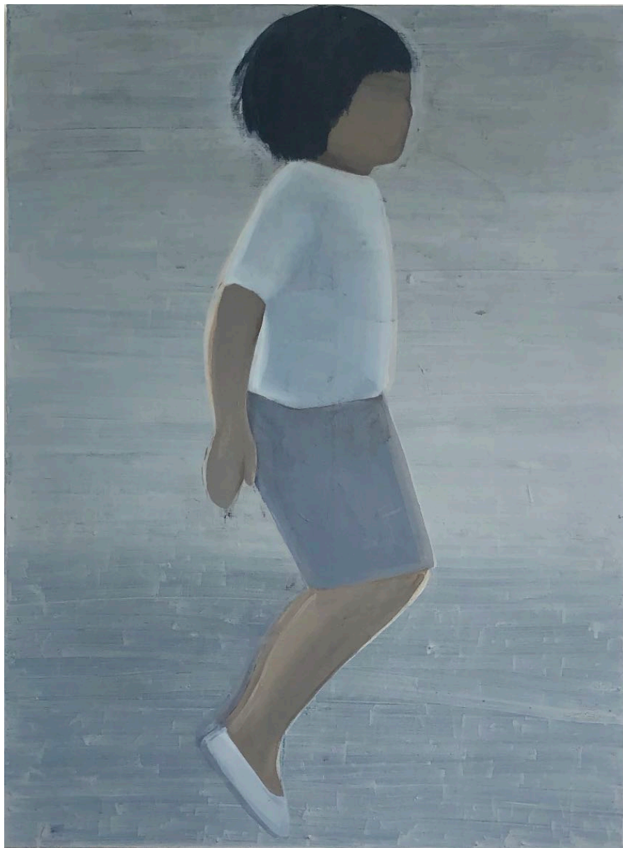
Miho Sato School Ground 4 2020, 95x70.5cm acrylic on board