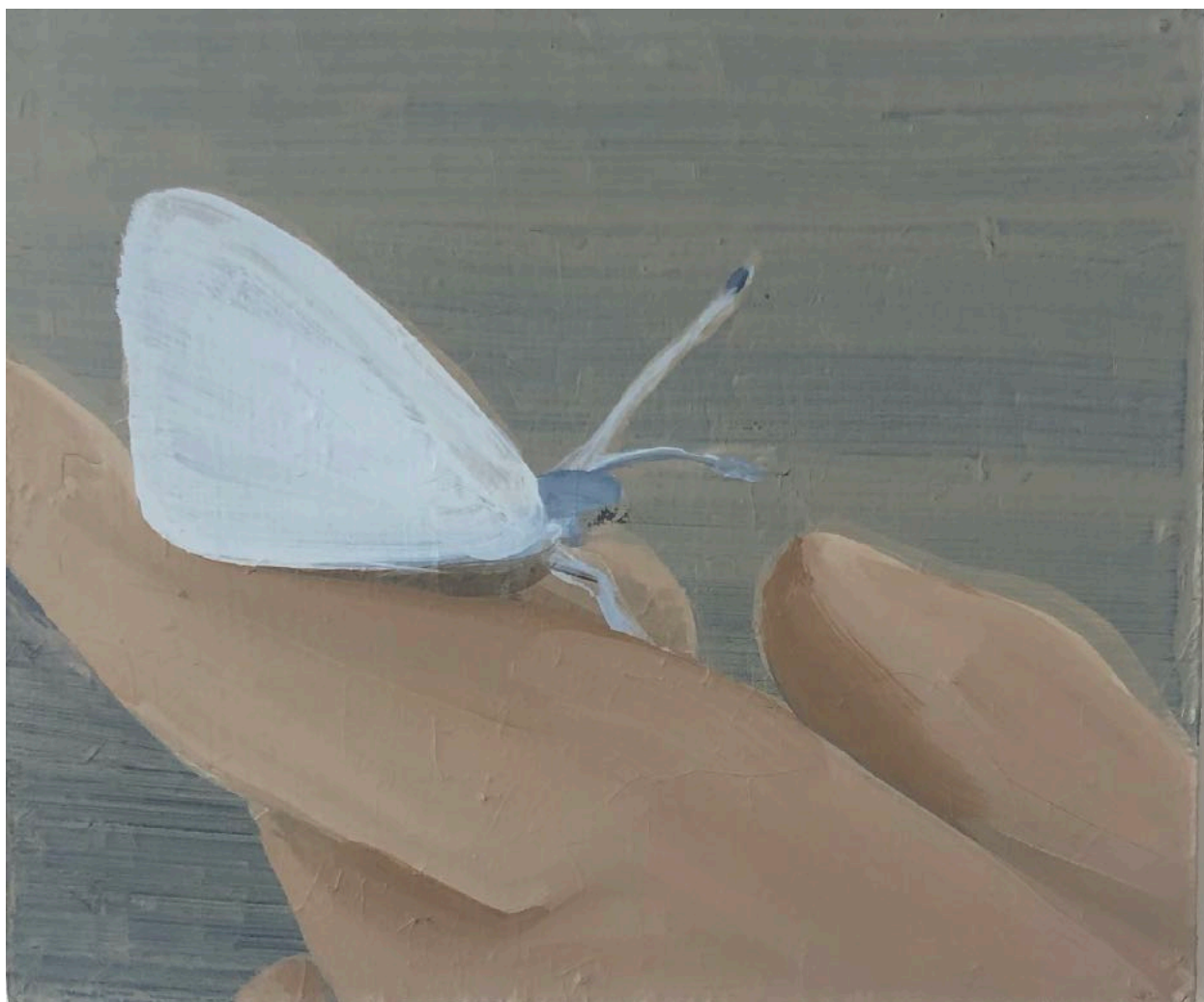
Miho Sato Butterfly on the finger 2020, 25.5x30.5cm acrylic on board