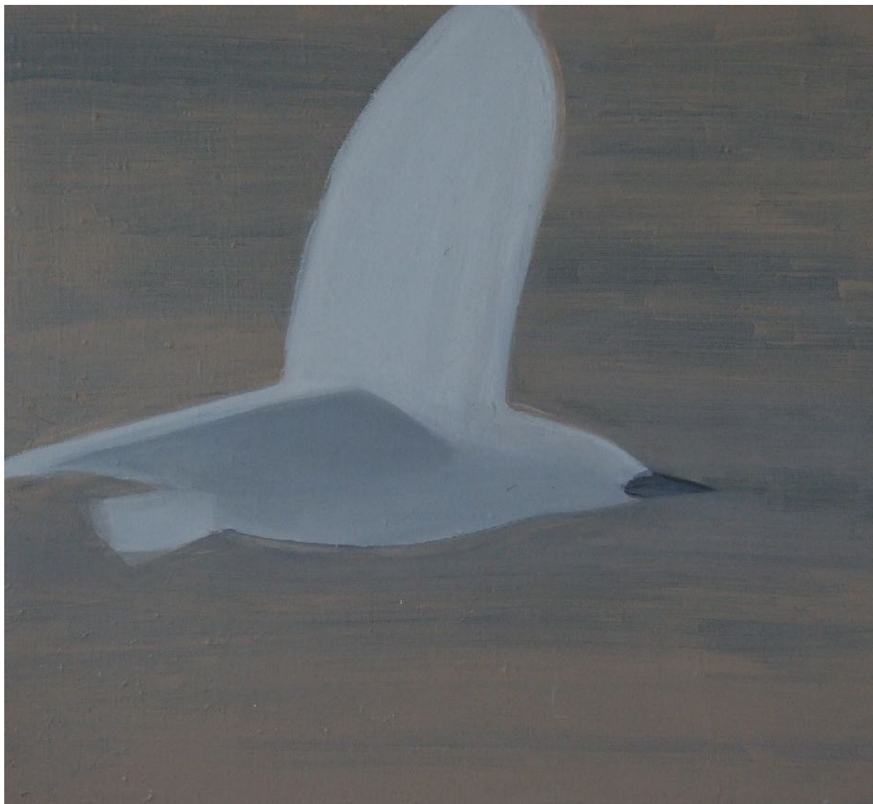
Miho Sato Untitled (gray 1) 2017, 61x66.5cm acrylic on board £4,200 (+20% vat)