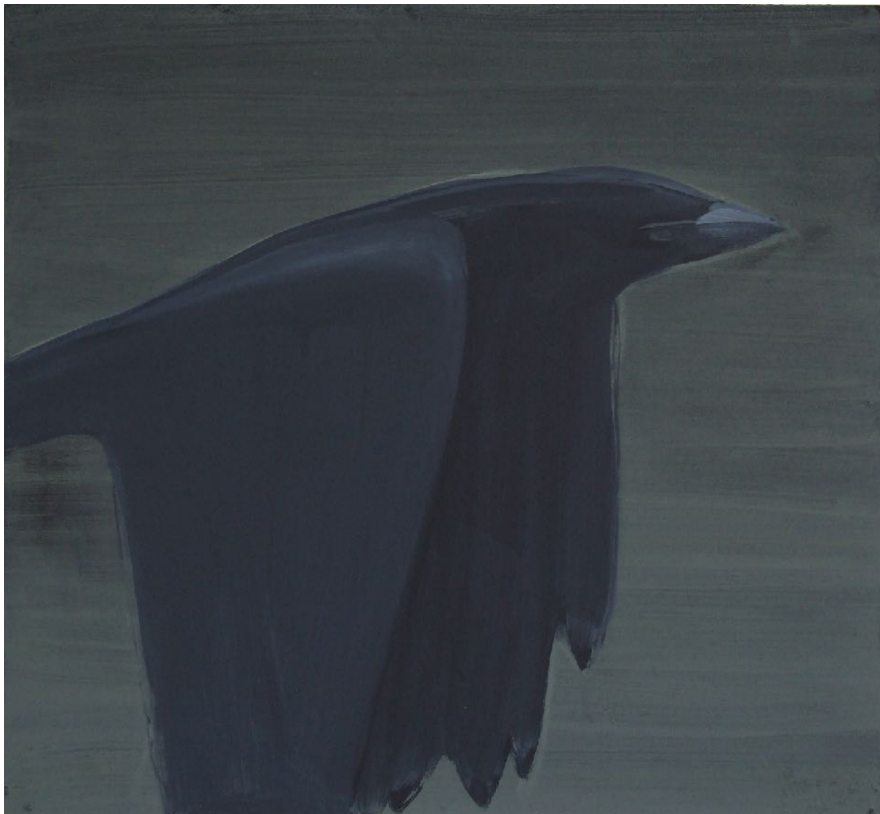
Miho Sato Untitled (gray 2) 2017, 61x66.5cm acrylic on board £4,200 (+20% vat)