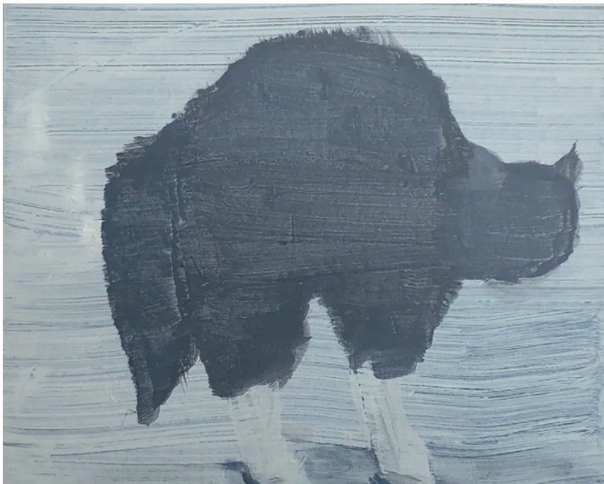
Miho Sato Untitled (cat) 2016, 21x26cm acrylic on hardboard £2,300 (+20% vat)