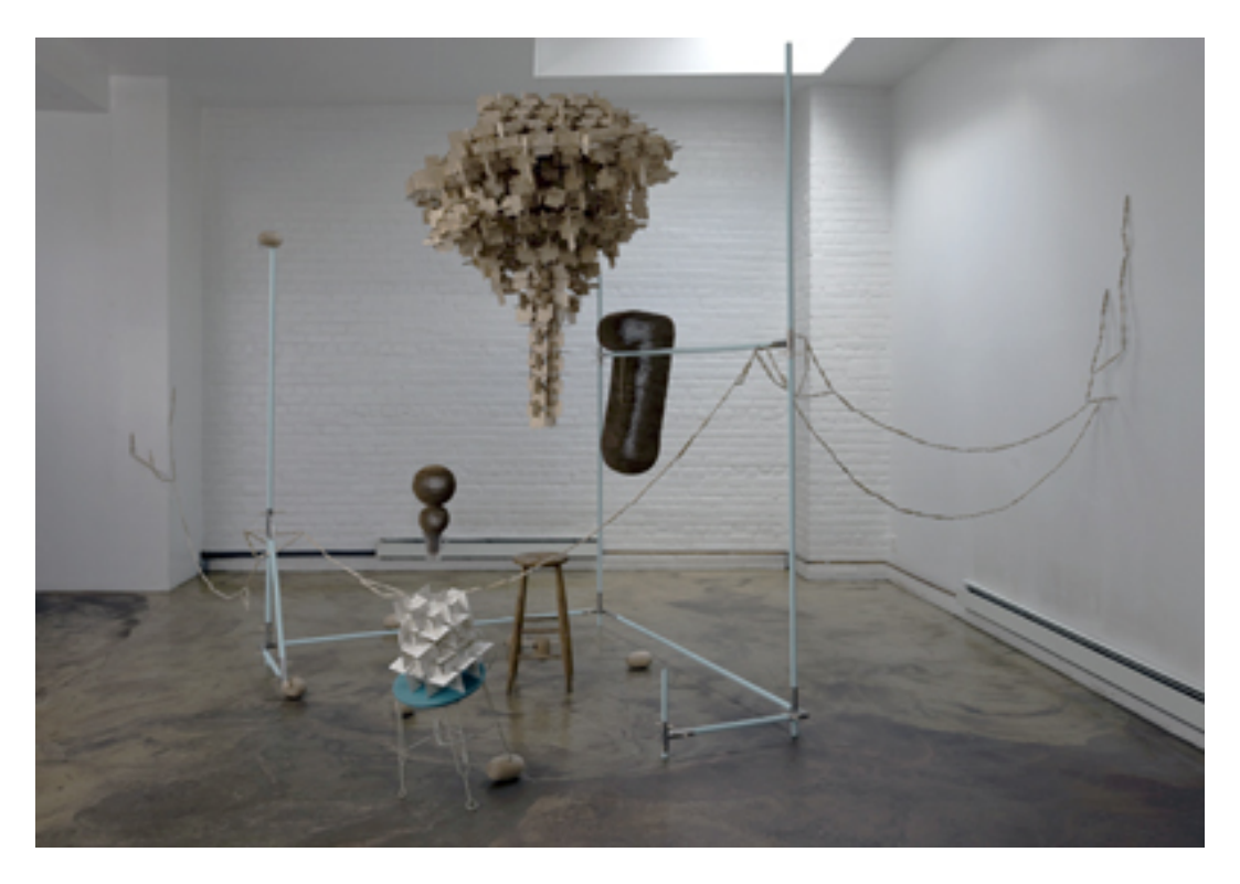
Maud Cotter. Rumpus Room, 2009, installation shot, Point B, Project Space, Williamsburg, New York; courtesy the artist

material. The present economic downturn adds an atmosphere of contemplation to this revision. Rumpus Room seeks a mechanism within built structure that will transform it. It seeks an internal system, or series of systems that will, through their expression, release a new energy, prompting a turning of function to other ends. The contents of Rumpus Room wishes to turn the notion of the conventional room as container inside out. Framed within a skeletal structure, under the pressure of its contents, Rumpus Room will cluster, presenting a desire to break the bonds of the forms that bind us. [2]