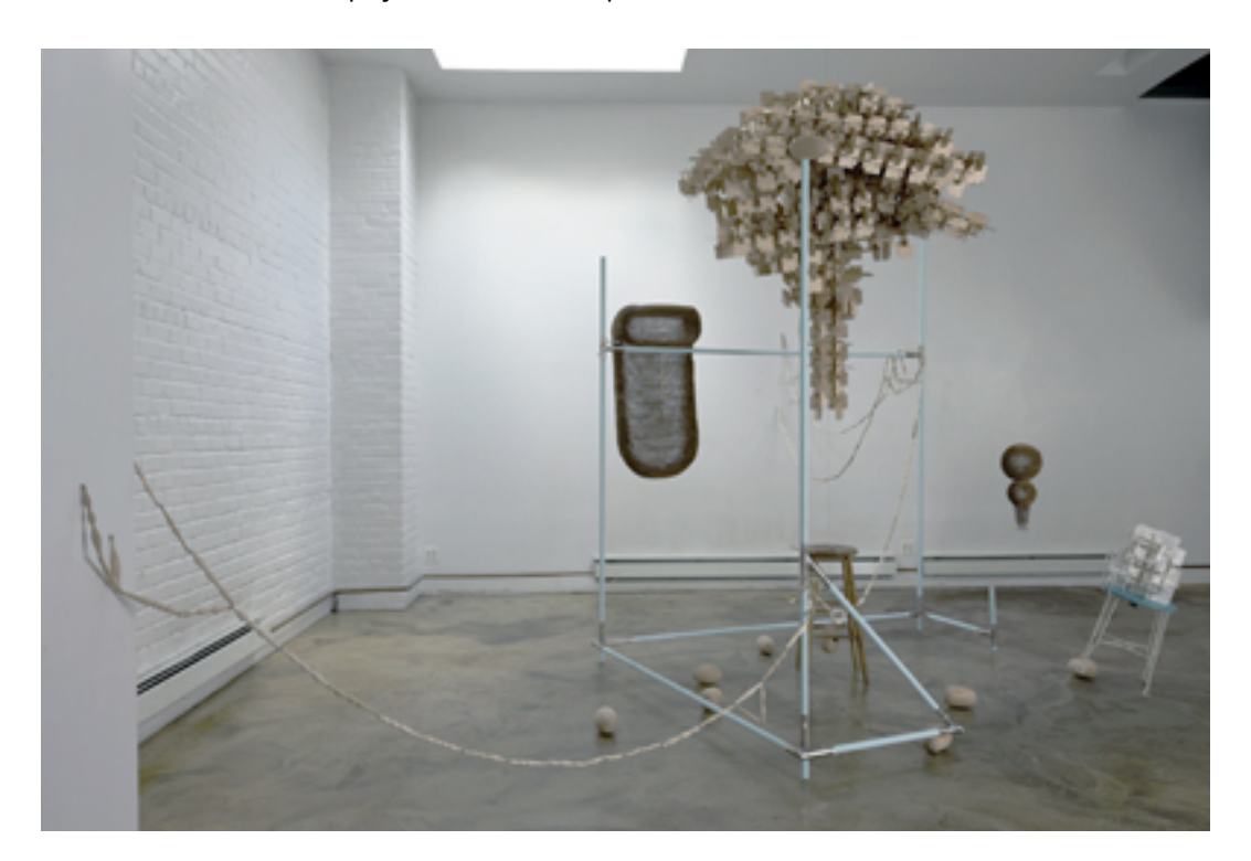
Maud Cotter. Rumpus Room, 2009, installation shot, Point B, Project Space, Williamsburg, New York; courtesy the artist

The shifting of weight from the physical elements of Rumpus Room is an important part of the piece for me. The woven cardboard element is even more tentatively suspended, and is meant to convey a sense of vulnerability. I imagine interaction with the piece as a meeting place in the fabric of the piece and the fabric of the mind of the viewer. The participation and interaction of the two is a plastic interwoven space, more of "knots of relations (connections)" [3], than a physical relationship.