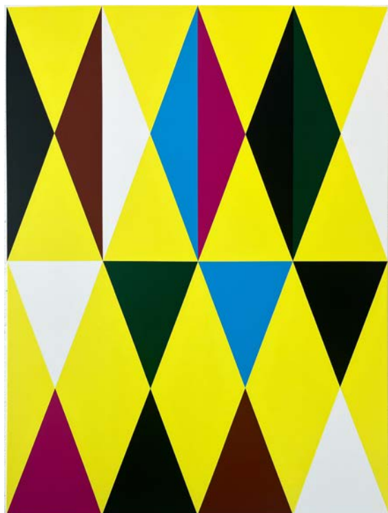
Summer acrylic on canvas stretched over a wood subframe 180 × 135cm 2022