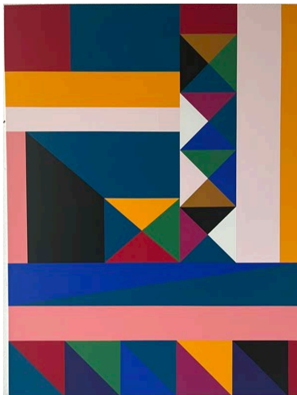
Autumn acrylic on canvas stretched over a wood subframe 180 × 135cm 2023