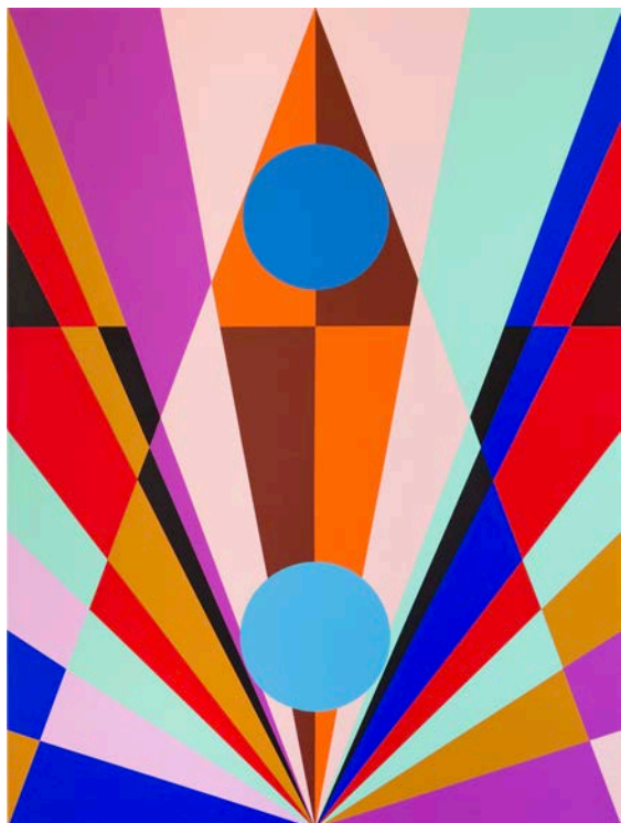
Spring acrylic on canvas stretched over a wood subframe 180 × 135cm 2021