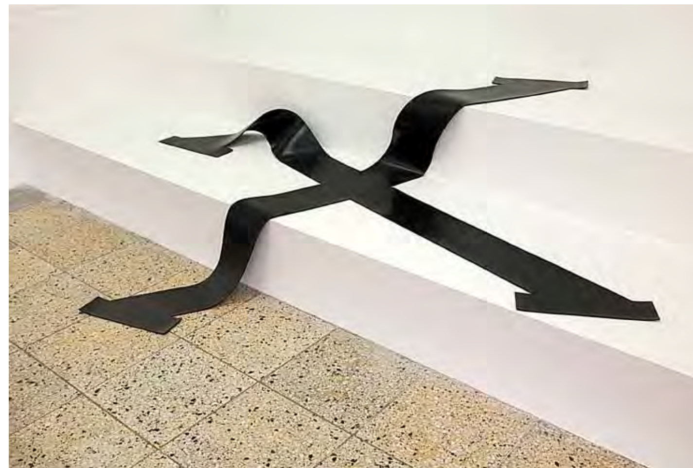
^ Lizi Sánchez, Blu2 Acrylic on aluminium and metal trestles, 90 x 100 x 300cm, 2016

LS: Yes, they really were freestanding objects in space. All of them had pom-poms, fabrics, ribbons and plastic pearls, and they were all influenced by kitsch architecture - things you will find in Peru. But whilst doing that I also did a residency in China,