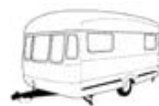
'Back to the land'