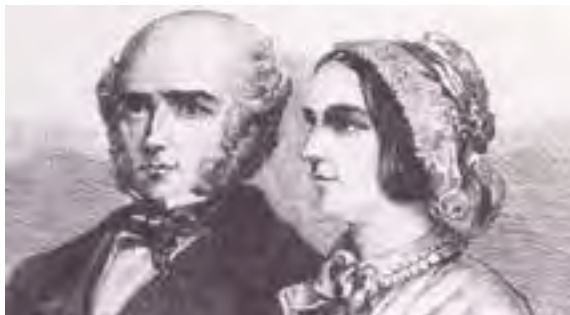
William and Mary Howitt

William (1792-1879) and Mary (1799-1888) Howitt (married 1821), individually, and in collaboration, wrote poetry, fiction and criticism concerned with the topography and sociology of a rapidly urbanising society. Like a number of their culturally empowered contemporaries, they perceived significant discord resulting from the meeting of urban, industrial culture and the past times, spiritualism and way of life of traditional rural communities. The historical position of the Howitts* is significantly less than others such as the more politically engaged radical William Cobett or the aloof utopian ideologue, William Morris despite their having collectively published well over 100 texts. This significant body of work factually documents and celebrates in imaginative prose a connection between people and place wholly removed from the alienated individualism of urban life. The stewardship of natural resources in agriculture rather than the city's domination of the earth; the reciprocal relationship with the land of those who settled it and their responsibilities to share the earth's bounty with those who were at its mercy. †