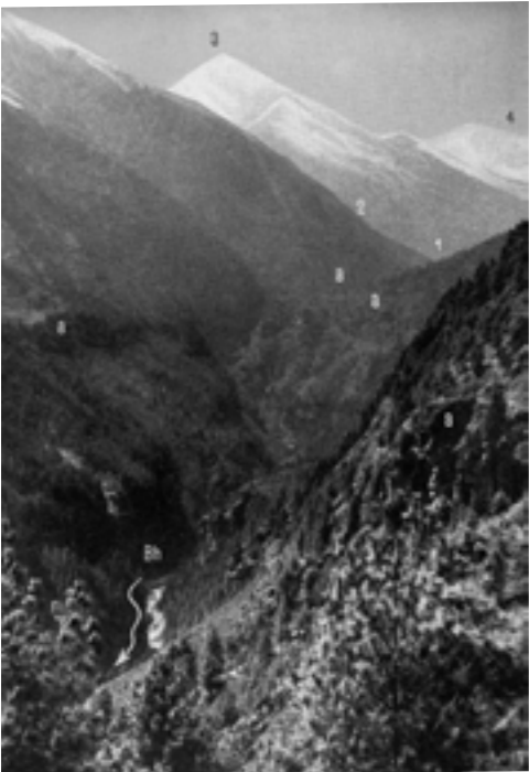
‘Snow - leopard’ Undated RCA archive.