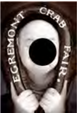
‘Hideous - Dreadful - Bestial - Frightful- Awful - Gruesome’