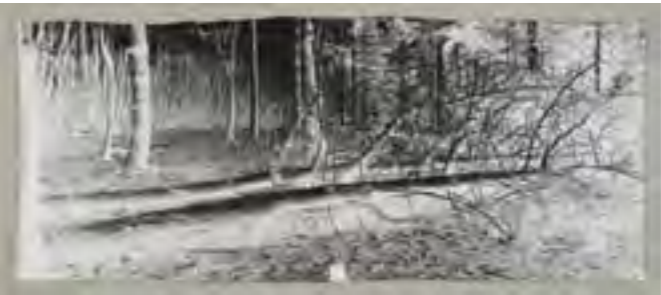
‘Standard Image #03, ’, undated.

*‘How can the feelings aroused by form be explained?’ is a question voiced most loudly by those who have never experienced them ... in order to pacify those who doubt and to pave their way into the world of form, I should like to describe the emotive effect of the elements of form and their constituent parts’ [:]