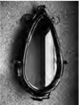
‘Facetious - Coquettish - Affected - Sweet - Insipid - Vacuous’