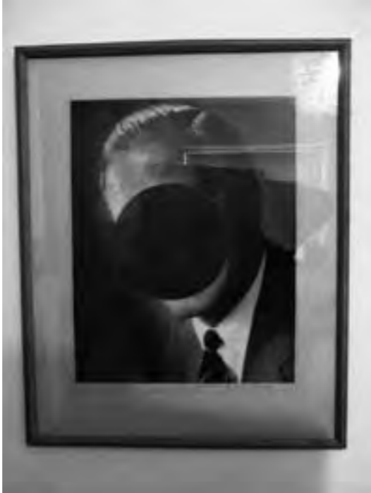
Untitled, undated.