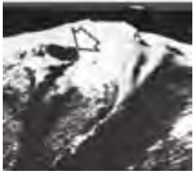
Mount Howitt, Victoria, Australia. (South Eastern Slope).

† Vagrants, vagabonds: 'idle people who roved about the country and asked charity under pretense of going 'a la Sainte Terre,' to the holy land, till the children exclaimed "There goes a Saint-Terrer,' a saunterer, a Holy Lander.' - Thoreau, H. D. 'Walking', 1851.