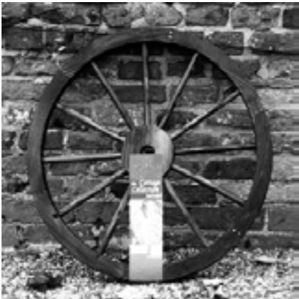
Untitled, undated. Label reads ‘The Cottage Collection’.