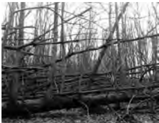
Contemporary Art Rural Tour, Wrabness, Essex, 30th March 2013.