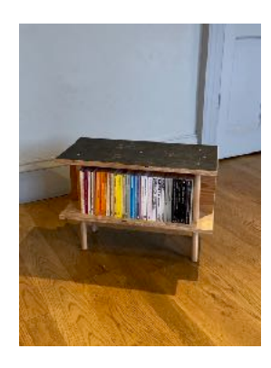
Scenario (principles of practice, bookshelf) (sketch with re-used cladding and broomstick handles and paperback books)

Taken from the pages of Autoprogettazione? A manual of self-assemble furniture published by Enzo Mari in 1974, who believed that if people were encouraged to build a table with their own hands, they would be able to understand the thinking behind it.