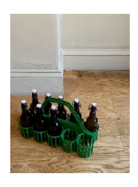
Scenario (lost) (eight bottles, flip top lids, home made pear ale) £17.99 each

With a handful of windfall, pocketed from the weeping pear tree. Their weight in my pockets prompted the translation as a toast to Barbara.