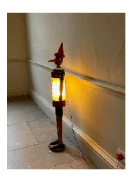
Scenario (gaze) (standing lamp)

In an attempt to rid the allotment of the prolific bindweed, fragments of all sorts appeared. From the millions of pipes produced since that first draw from Sir Walter Raleigh, there were enough to sink a battleship.