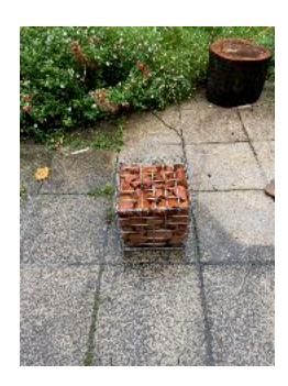
Scenario (bag of sand) (gabion, weathered bricks)

Living on a fragile peninsular, the gradual erosion presents evidence of structures that sat on the cliffs above. Bright red pebbles quietly reveal their former life as the walls of a battery.