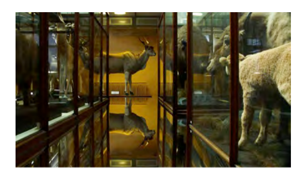
REPORTS TO AN ACADEMY # 1 10:35 MINS

THIS SERIES TAKES ITS TITLE FROM THE FRANZ KAFKA SHORT STORY 'A REPORT TO AN ACADEMY'. IN THE STORY AN APE RECOUNTS HIS DELIBERATE ACQUISITION OF A HUMAN IDENTITY AS A MEANS OF SURVIVAL IN THE AFTERMATH OF CAPTIVITY. THE WORK TAKES THIS IDEA OF IDENTITY AS PERFORMANCE AND EXPLORES IT THROUGH MULTIPLE LOCATIONS: AN ARCHETYPAL WEST OF IRELAND LANDSCAPE; A NATURAL HISTORY MUSEUM; AN ARTIST'S STUDIO; AND A LIBRARY. IT QUESTIONS THE ASSUMPTIONS AROUND AUTHENTICITY AND REPRESENTATION SUGGESTED BY THESE LOCATIONS, WITH EACH SETTING ULTIMATELY REVEALED AS BEING EQUALLY MEDIATED. USING FILM AND COMPUTER-GENERATED IMAGERY, LANDSCAPE, MUSEUM, LIBRARY AND STUDIO ARE RE-IMAGINED AS STAGE-SETS IN WHICH IDENTITIES MIGHT BE CONSTRUCTED AND FALSE REALITIES FORGED. REPORTS TO AN ACADEMY IS STAGED AS A FOUR-SCREEN INSTALLATION. THE FOUR FILMS ARE LOOPED AND OF VARYING LENGTH, CREATING A CHANGING SET OF IMAGE COMBINATIONS. A SINGLE SOUNDTRACK LINKS ALL FOUR SCREENS.