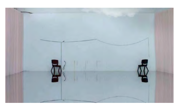
REPORTS TO AN ACADEMY # 2 11:30 MINS