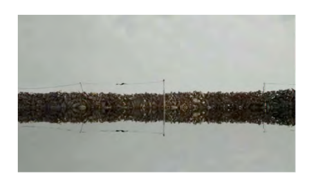
REPORTS TO AN ACADEMY # 3 10:00 MINS