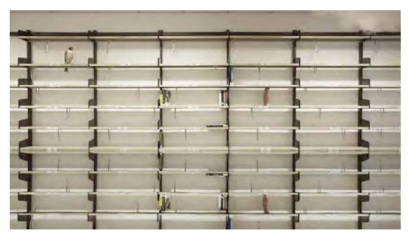
REPORTS TO AN ACADEMY # 4 09:35 MINS