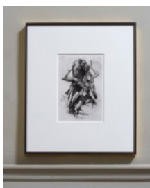
THE MUSES V

WALNUT, PERSPEX, CERAMIC, ACRYLIC PAINT, STONE, 2023 91.5 X 104 X 61CM (INSTALLATION DIMENSIONS)