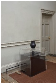
INSCRIPTIONS V, PART 9

WALNUT, PERSPEX, CERAMIC, ACRYLIC PAINT, STONE, 2023 91.5 X 104 X 61CM (INSTALLATION DIMENSIONS)