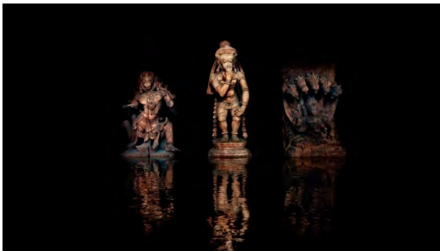
Still from Inscriptions of an Immense Theatre , single channel film, 2018.