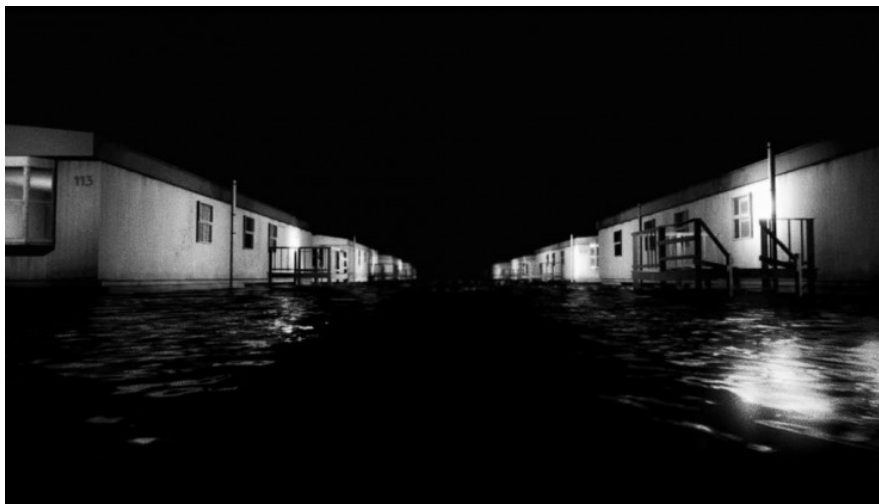
Still from Inscriptions of an Immense Theatre , single channel film, 2018.