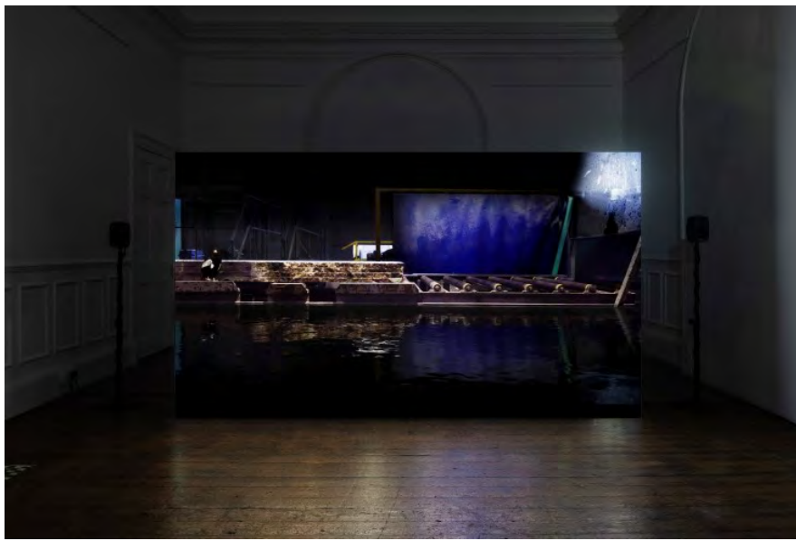
Installation view, Inscriptions (One Here Now), Sirius Arts Centre, 2019.