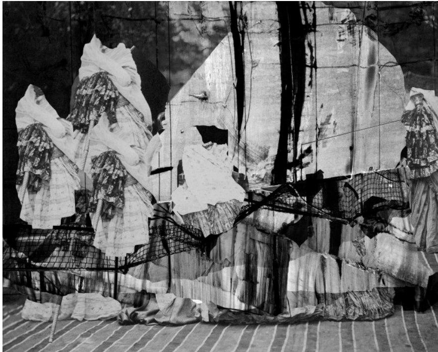
The Muses IV , pigment print on bamboo paper, 2018.