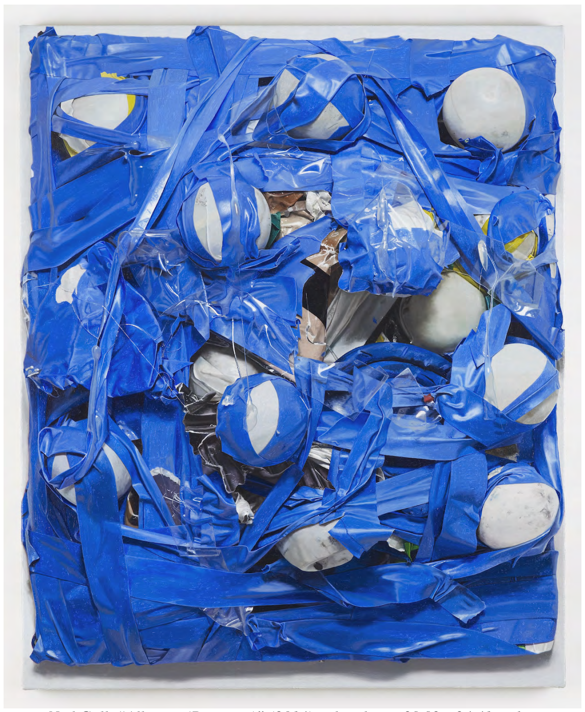
Neil Gall, "Allegory (Bronzino)" (2014), oil on linen, 29.92 x 24.41 inches

The feeling of bondage in Gall's work continues in this show, but encompasses the background as well as the figure, and in fact confuses and entangles the two. The drawing "Ghost" (2015), its edges pulled and torqued, approximates a diamond. The tape performs two roles: as a background, it subsumes the figures within it (the white orbs); as part of a three-dimensional model, it also acts as the dominant figure in the composition.