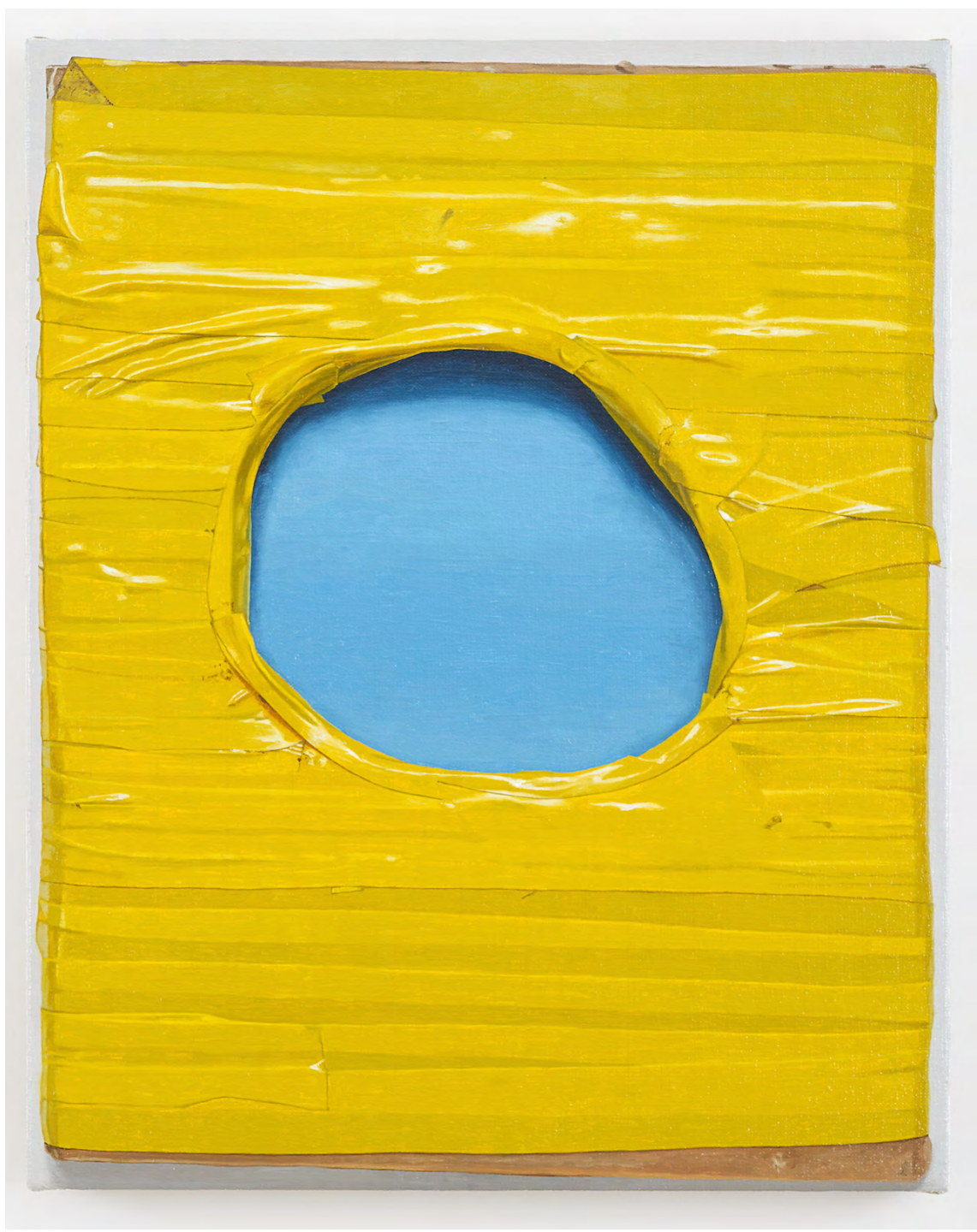
Neil Gall, "Sky Hole" (2015), oil on linen, 18.5 x 14.76 inches

What Gille Deleuze calls an Exogamous force in his 1988 book, The Fold: Leibniz and the Baroque , is here in full display: we see an outward system (strips of tape) acting on another system (a rectangular frame, Ping-Pong balls) to form and shape it. Half-deflated balls reveal the impact of this external force. Or is this an endogamous system — of folds revealing other folds, existing coherently as a structure and form in itself? Is this background a living landscape, full of forces intrinsic to it?