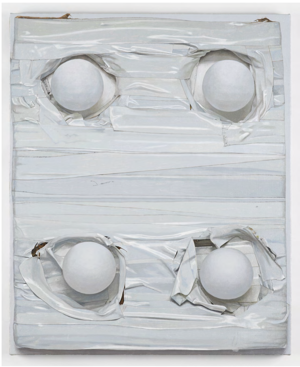
Neil Gall, "Kitchen (Velázquez)" (2015), oil on linen, 29.13 x 23.82 inches

Gall gestures toward a wide array of painters, from Bronzino to Nicolas Poussin to Barnett Newman, and his tape and ping-pong ball models lend a touch of silliness to a painterly tradition that used sculptural maquettes as preparatory tools. In "Allegory (Bronzino)" (2014), a "solid" plane of tape echoes the blue background of Bronzino's "An Allegory with Venus and Cupid" (ca.1545), and white balls, some barely visible within the blue tape, are analogous to Bronzino's composition, where submerged heads and hands eerily emerge from varying depths of the background, bodies twisting and arms reaching, with no one place for the viewer's eye to rest. In Gall's composition, the blue material actively stretches, taking the place of the fingers and hands: the background reaches into the figure, and the figure is partially subsumed into background.