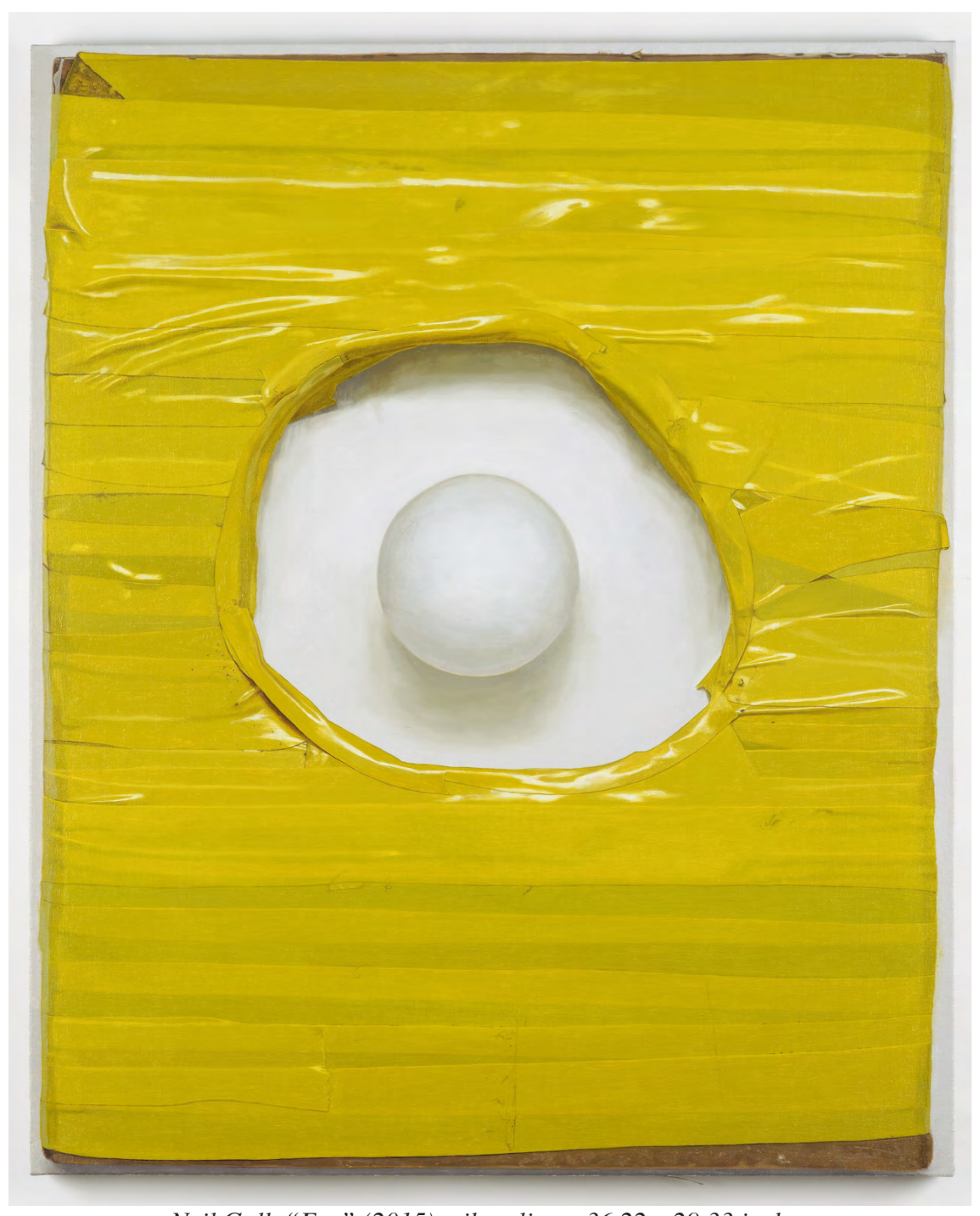
Neil Gall, "Eye" (2015), oil on linen, 36.22 x 29.33 inches

Gall uses materials of assembly and repair (tape, glue, plastic wrap, tinfoil), but also of play. They bear no particular cultural or allegorical meaning. All the more strange and even humorous, then, are the anthropomorphic associations of his work, as when a white, cycloptic sphere seems to stare out from a background of yellow tape in the painting "Eye" (2015). Yet the personification never fully is complete: the materials remain singular enough that one never forgets the reality of colored tape and white balls.