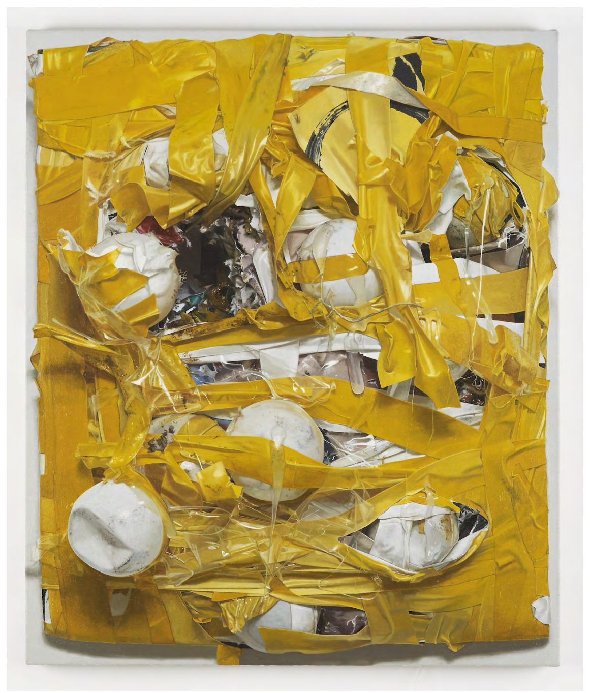
Neil Gall, "Yellow (Poussin)" (2014), oil on linen, 29.13 x 24.41 inches

Figure Is to Background as Representation Is to Model: Neil Gall's 'Cut-Outs, Offcuts and Holes' by Kate Thorpe on May 30, 2015