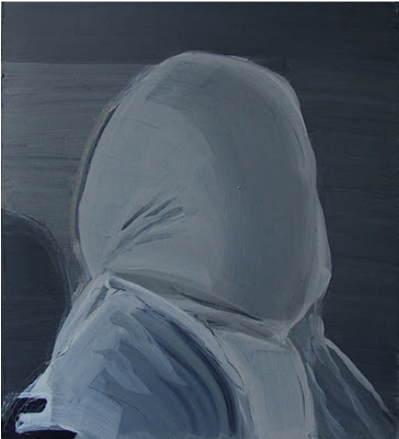
Russian Actress, 2012

AS: It's interesting how little detail is needed to recognize your Moomin . I guess that is the theme of the exhibition, Minimal Excess .