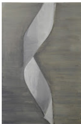
Paper Wristband, 2009

Also, in Slovakia, I showed one, called Ceiling , which came from a photo from my flat and Holes is from my studio wall, so that kind of thing.