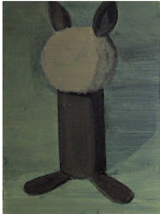
Complexity of Adulthood 3, 2009

MS: No, it is from a children's Ladybird book. The book was about how to make a rabbit. It had lovely illustrations. I have used one before for a girl skipping. It doesn't look like the actual illustration, but the colour is something I pick up. At the moment I use more green and grey, which is a lot of colour for me.