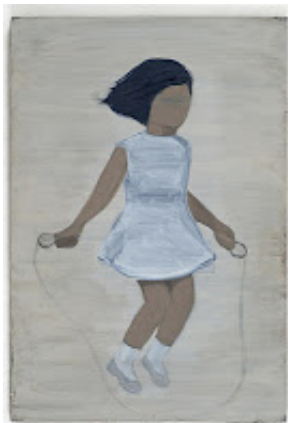
Girl with White Dress, 2008

AS: The trolls, moomins and gonks link with a Western idea of Japanese artists looking at cute, cartoon types of imagery, like anime or kawaii. Do you see any connection?